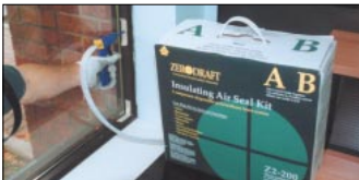
Zerodraft Insulating Air Sealant being applied behind window frame.

In addition to general construction, other industries where Zerodraft Insulating Air Sealant is used include agricultural, boating and marine, cold storage, mining, petrochemical, pools and spas, refrigeration, transportation, and utilities.